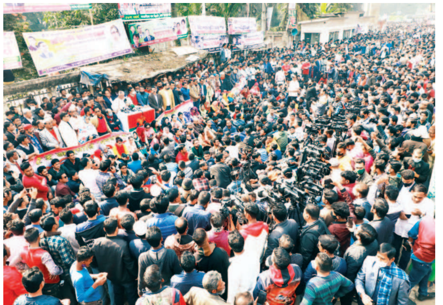
Demanding BNP chairperson Khaleda Zia's immediate release and better treatment abroad, Dhaka north and south city units of the party held a human chain in front of Jatiya Press Club yesterday.