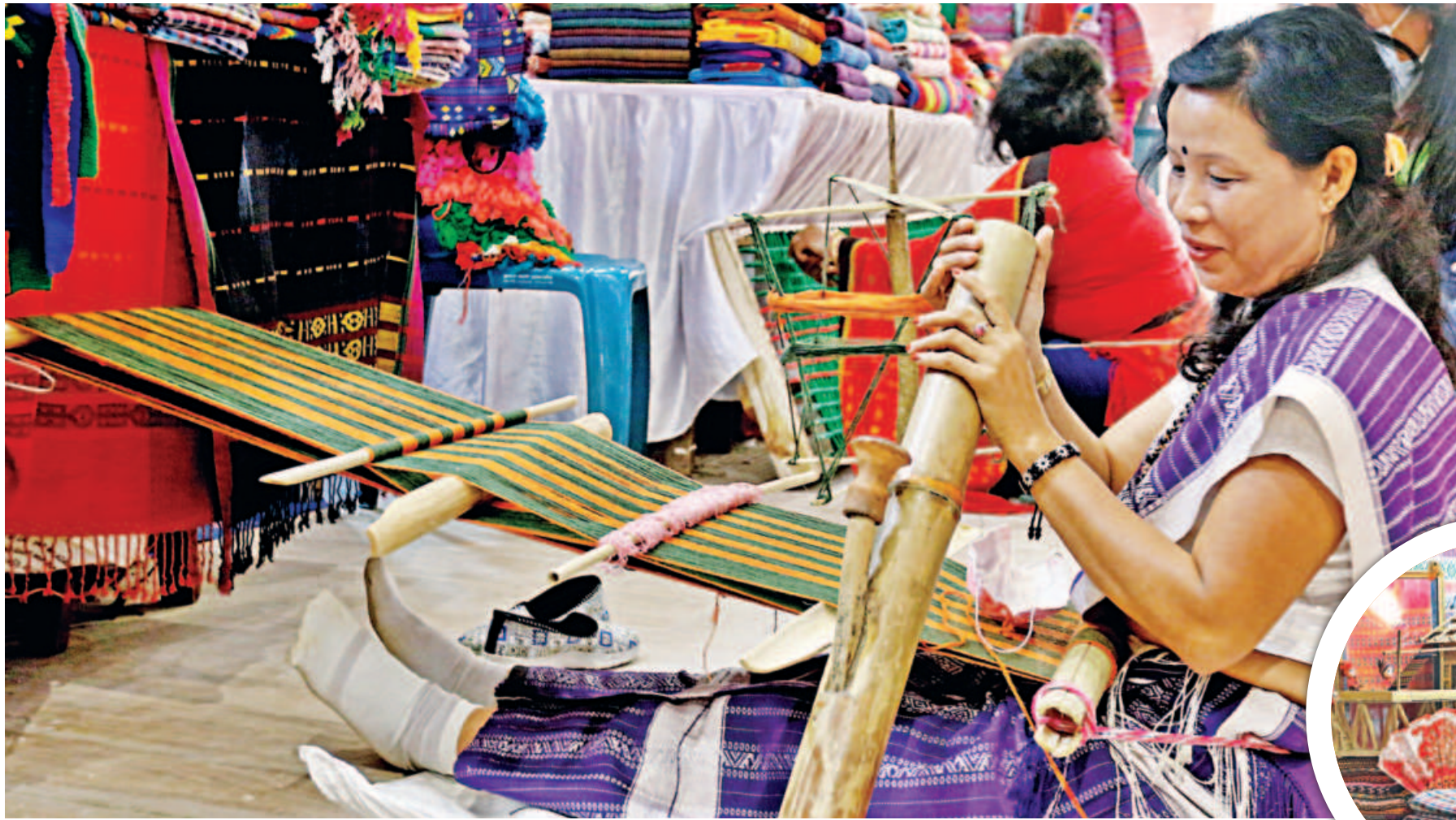
A woman sits beside a weaving machine, holding a traditional hookah of the hills at the Parbatya Mela organised at Sheikh Hasina Chittagong Hill Tracts Complex in the capital yesterday. The four-day fair includes traditional food, clothes and other items of the hill tracts, and cultural performances by artists from Rangamati, Bandarban and Khagrachhari.