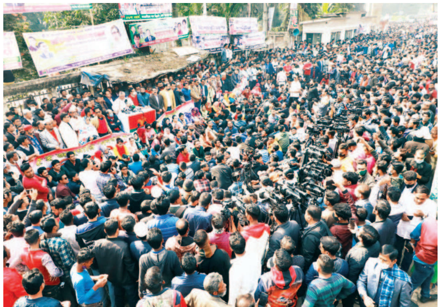
Demanding BNP Chairperson Khaleda Zia's immediate release and better treatment abroad, Dhaka north and south city units of the party formed a human chain in front of the Jatiya Press Club yesterday.