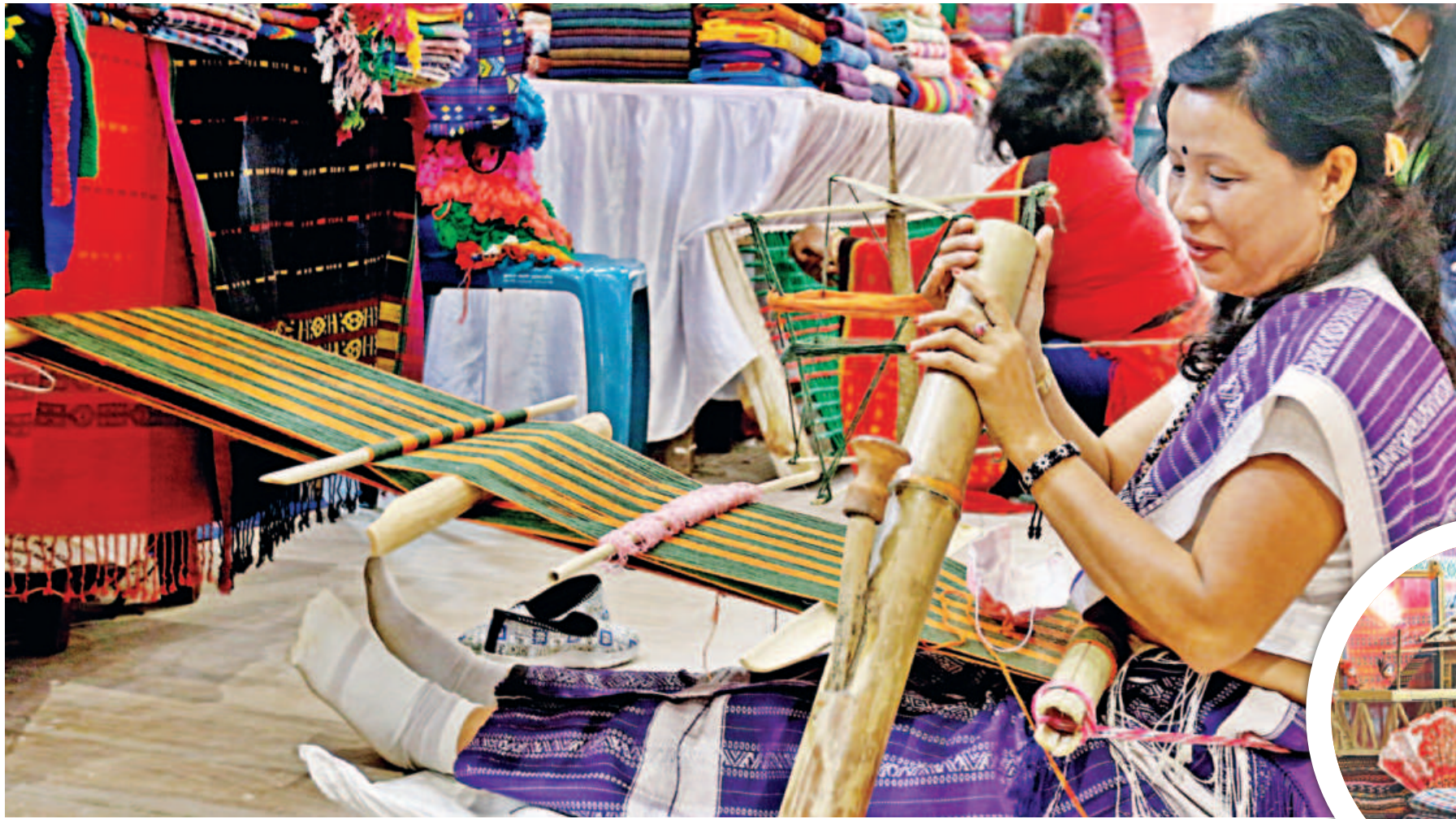
A woman sits beside a handloom, holding a traditional hookah of the hills at the Parbatya Mela organised at Sheikh Hasina Chittagong Hill Tracts Complex in the capital yesterday. The four-day fair includes traditional food, clothes and other items of the hill tracts, and cultural performances by artists from Rangamati, Bandarban and Khagrachhari.