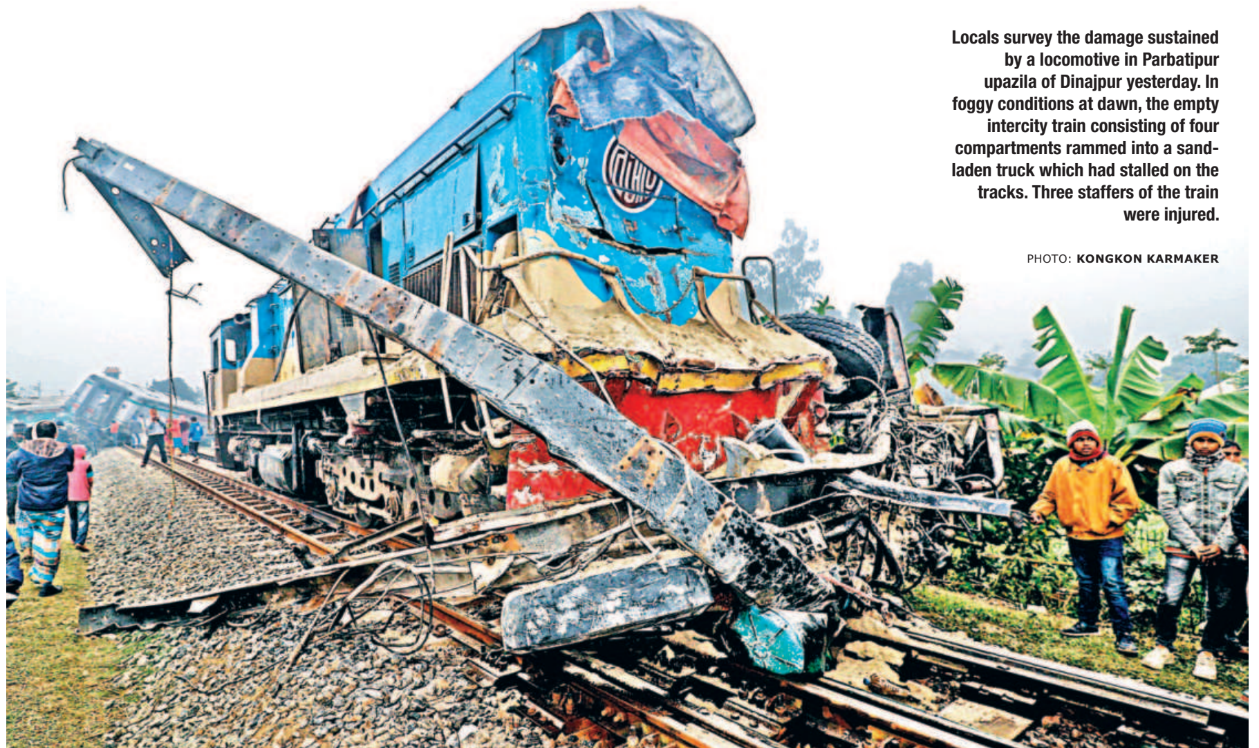
Locals survey the damage sustained by a locomotive in Parbatipur upazila of Dinajpur yesterday. In foggy conditions at dawn, the empty intercity train consisting of four compartments rammed into a sand-laden truck which had stalled on the tracks. Three staffers of the train were injured.