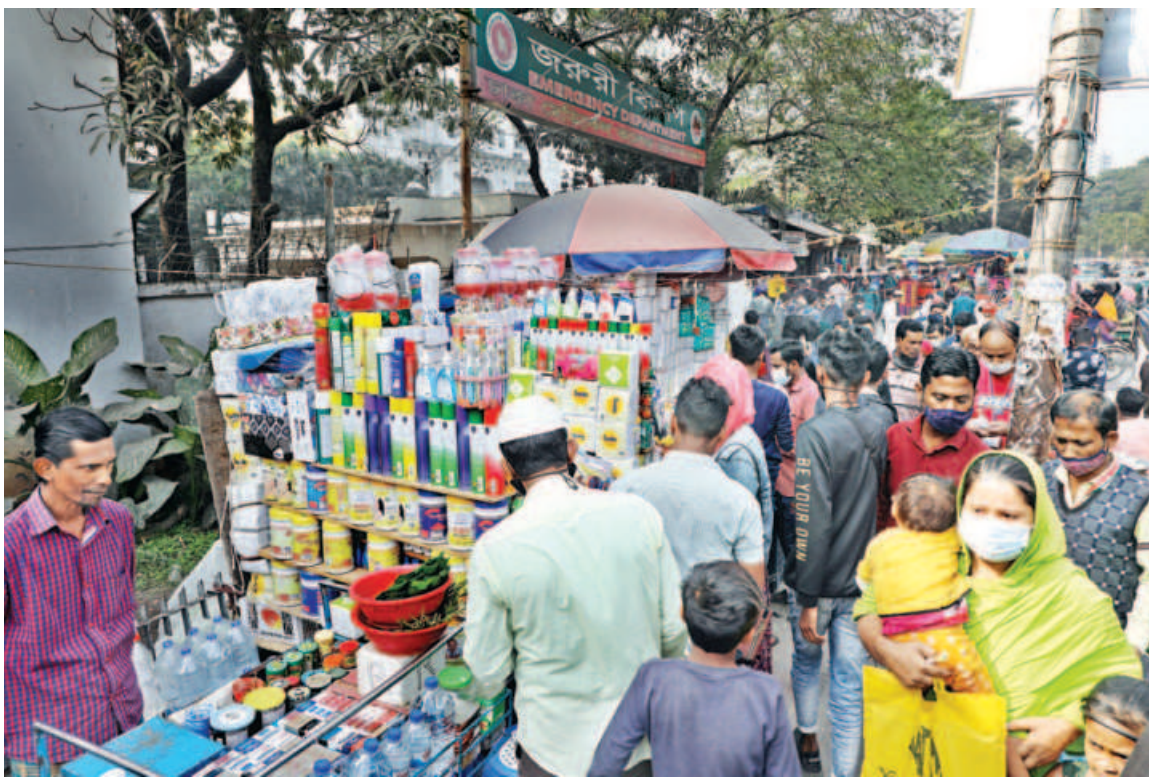
Illegal stores on the footpath in front of the Emergency Department of Dhaka Medical College Hospital obstruct patients and their attendants. The shops contribute to traffic congestions that delay ambulances reaching the department. The photo was taken around 1:00pm yesterday.