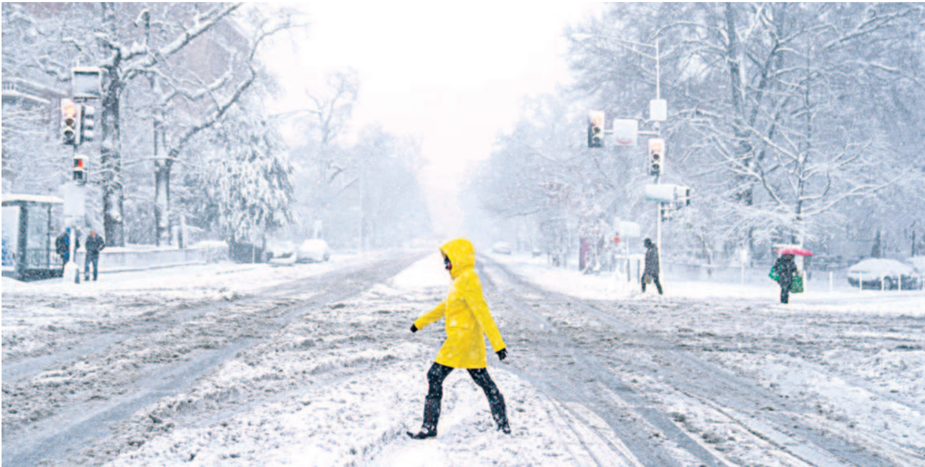
A person crosses a street during a snowstorm in Washington, DC, US, on Monday. A winter storm hammered the capital and other parts of the mid-Atlantic, with official forecasts of five to 10 inches (12.7 to 25.4 centimeters) of snow in Washington.