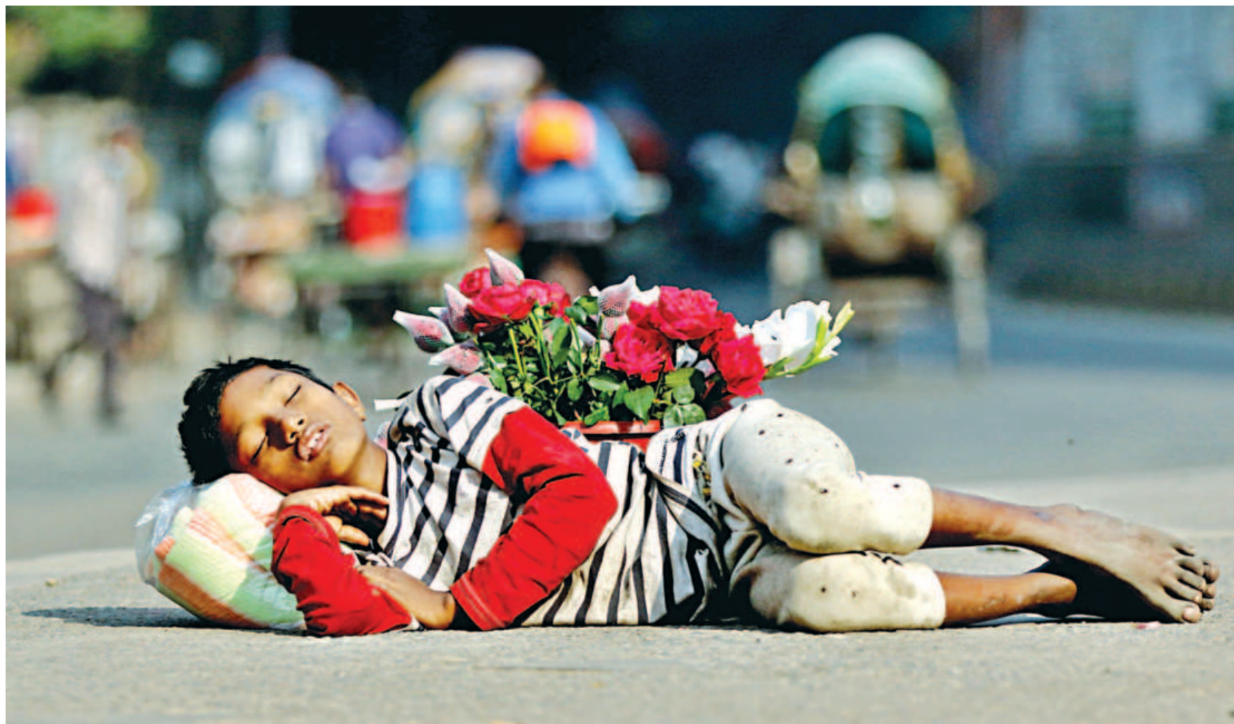
SEEKING WARMTH ... A young flower seller dozes off at the foot of the Raju Bhashkarja (memorial sculpture) in Dhaka University's TSC area while trying to soak in some sun on a chilly morning. Like him, children who live and work on the streets suffer immensely during the colder months due to a lack of warm clothes. The photo was taken yesterday around 10:00am.