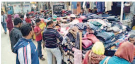
Temporary hawkers' markets for second-hand warm clothes in Faridpur town see a large number of people coming to buy used warm clothes.