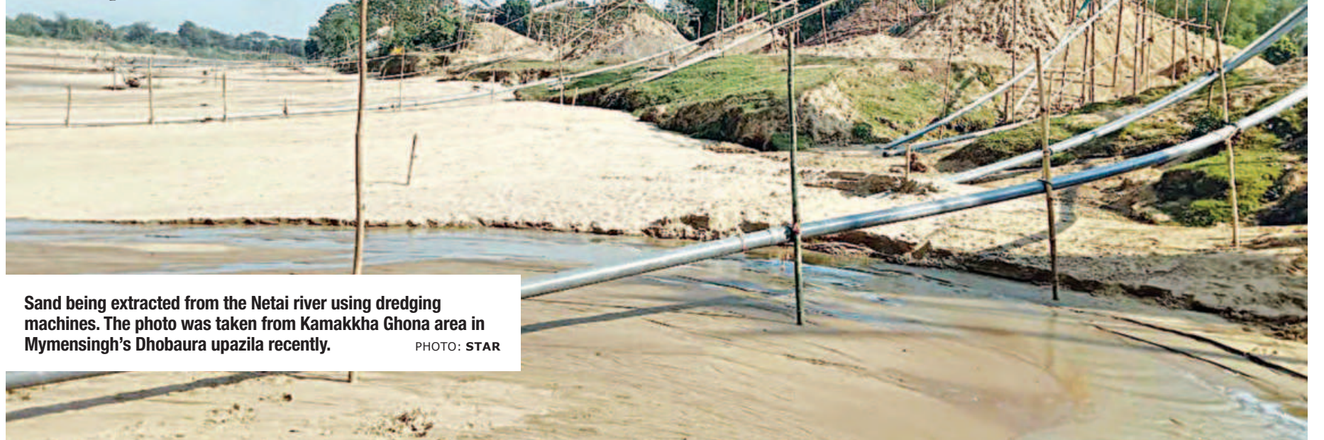
Sand being extracted from the Netai river using dredging machines. The photo was taken from Kamakkha Ghona area in Mymensingh's Dhobaura upazila recently.

The river needs to be preserved in its original shape because due to onrush of hilly waters from across the Indian border it has been an abundant source of country fishes, opined the AL leader.