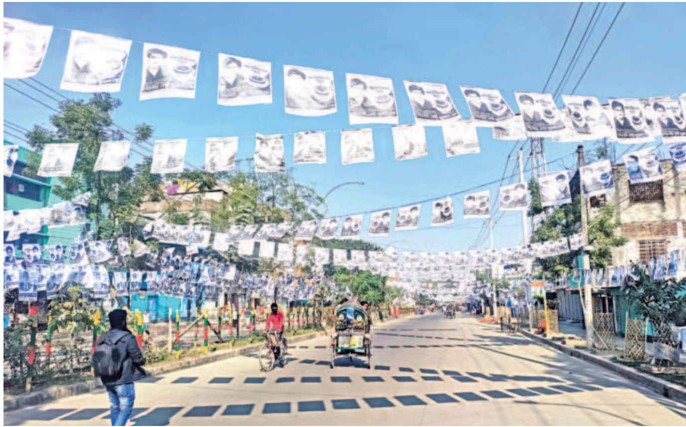
Posters line a street in Noarda area as politicians in Narayanganj launch full-on campaign ahead of the election to Narayanganj City Corporation scheduled for January 16.