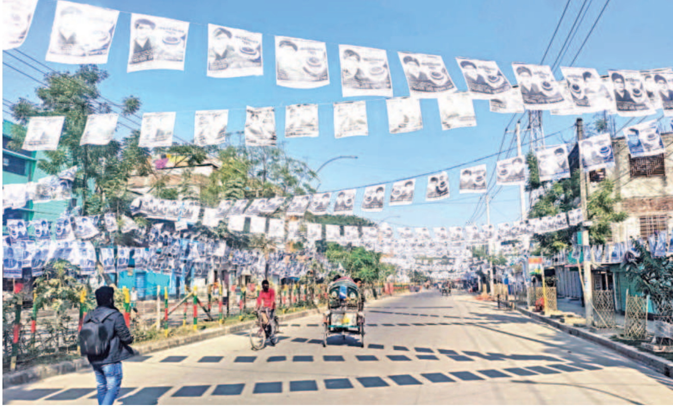
Caption..... 1 2