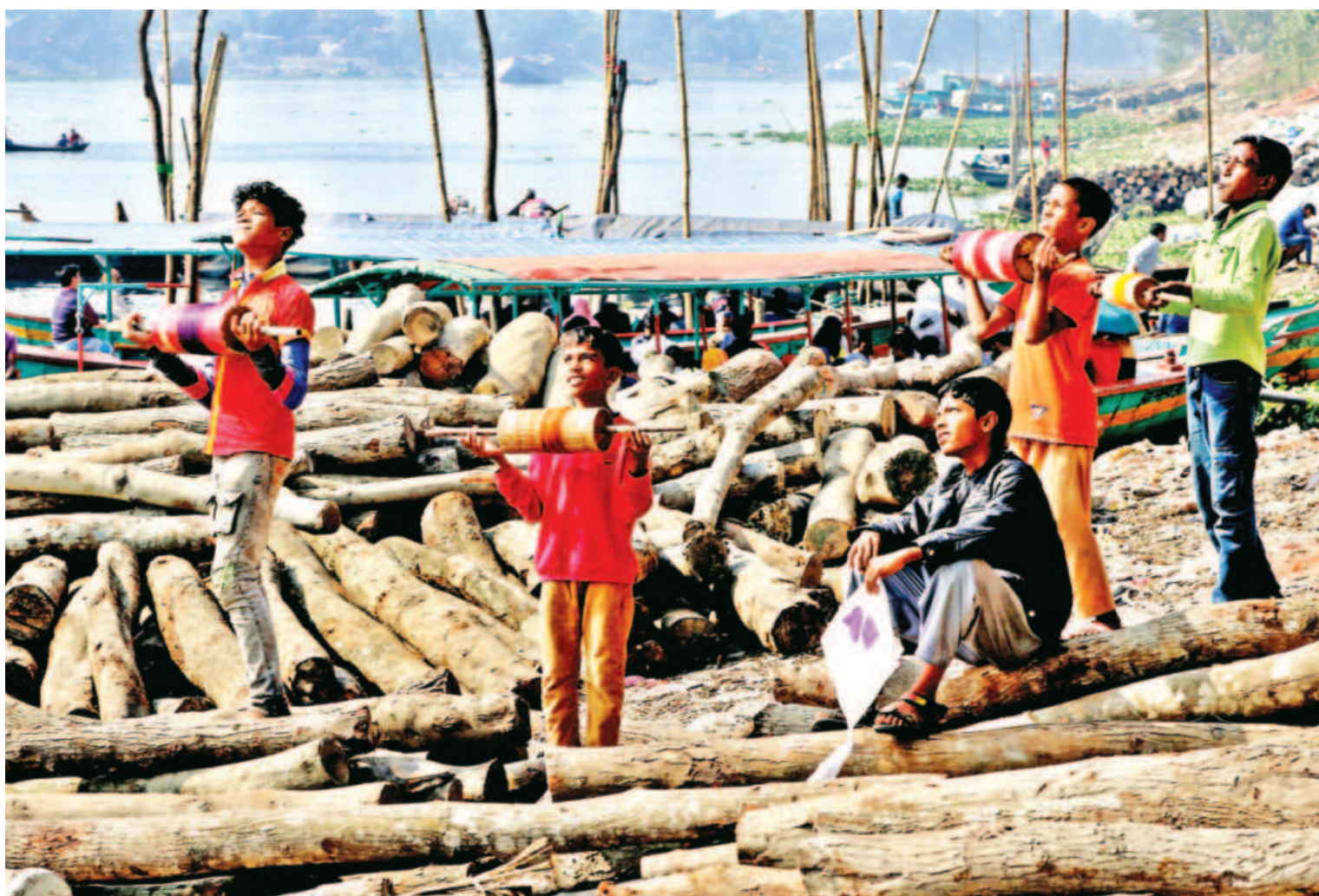
Four children gazing intently up at the sky as they control their kites, while another sits with his own kite in hand watching the action unfold. Kite-flying is a rich tradition all over Bangladesh, but with open spaces shrinking in urban areas the pastime is often restricted to rooftops and river banks. The photo was taken from the banks of the Buriganga in the capital's Lalbagh area recently.