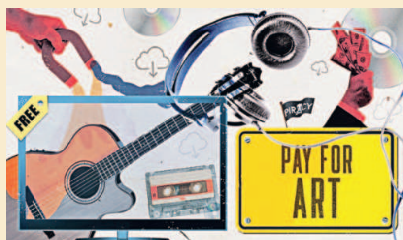
ILLUSTRATION: SALMAN SAKIB SHAHRYAR

SHABABA IQBAL "Black Widow" was one of the most pirated movies of 2021. Let's be honest for a second: Most of us have downloaded pirated versions of various pieces of entertainment: classic movies, vast discographies, video games and popular TV shows, at one point or another. As more and more streaming operators come to the market, often hiding their own content behind exclusive paywalls, the confusion and high cost of subscription risks driving users to piracy. The theft of intellectual property does not necessarily mean that the owners have lost something