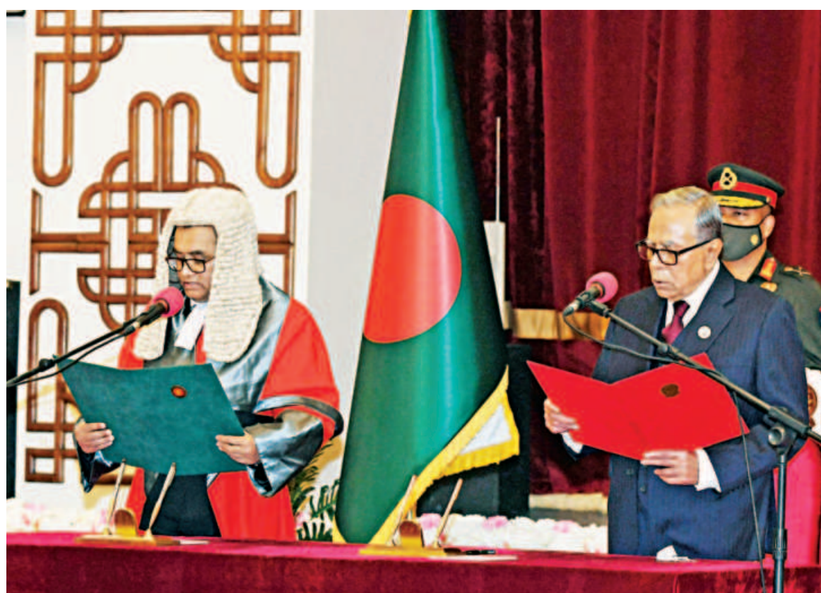
President Abdul Hamid administers the oath of office to Hasan Foez Siddique as the 23rd chief justice yesterday, a day after signing of the appointment. The president administered the oath at 4:00pm at Bangabhaban.