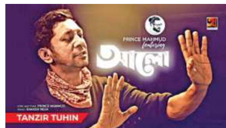
Eminent lyricist-composer Prince Mahmud gifted the fans "Alo".

Tanjib Sarwar crossed the 10-million mark with his hit single, "Dube Dube", while "Sa Re Ga Ma Pa" famed star Mainul Ahsan Noble impressed thoroughly in the latter half of the year with the release of "Ovinoy".