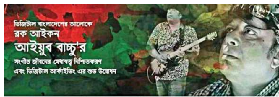
272 of legendary rockstar Ayub Bachchu's songs were preserved by the government.

Even though 2020 is considered to be a year of loss and uncertainty, the music industry's efforts to adapt and improvise is heartening. Heading into a fresh start, musicians are eagerly waiting to make the most of 2021.