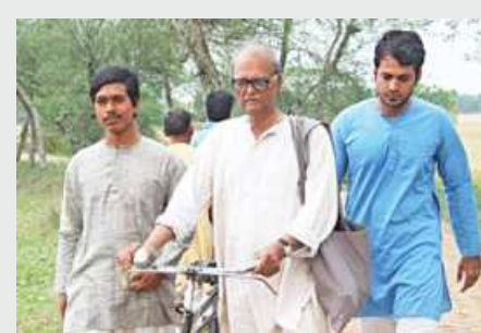
Rupsha Nodir Baanke

Due to various allegations, Bangladesh Chalachitro Shilpi Samity President Misha Sawdagar and General Secretary Zayed Khan were boycotted by 18 organisations. The organisations held a meeting, where they came to a decision to send a written application to BFDC's