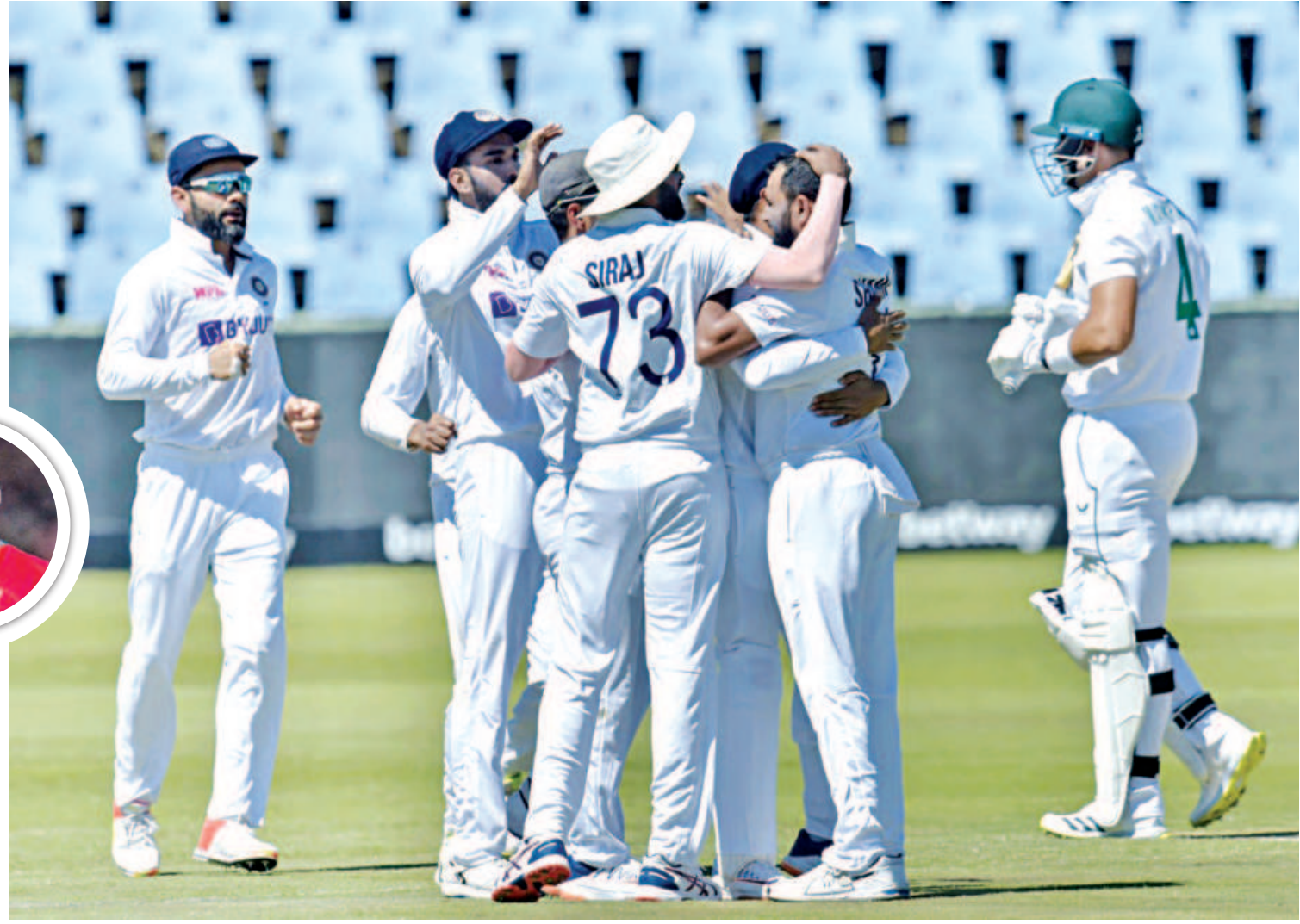
India pacer Mohammed Shami celebrates with teammates after the dismissal of South Africa's Aiden Markram during the fourth day of the first Test at SuperSport Park in Centurion yesterday.

Liverpool manager Jurgen Klopp, though, is more concerned that his side rediscover their brio for the Chelsea match. "It's a big gap," Klopp told the BBC. "To top that, Chelsea and us play against each other. "It was not our plan to give City the chance to run away. If we play like tonight we cannot think about catching up with City."