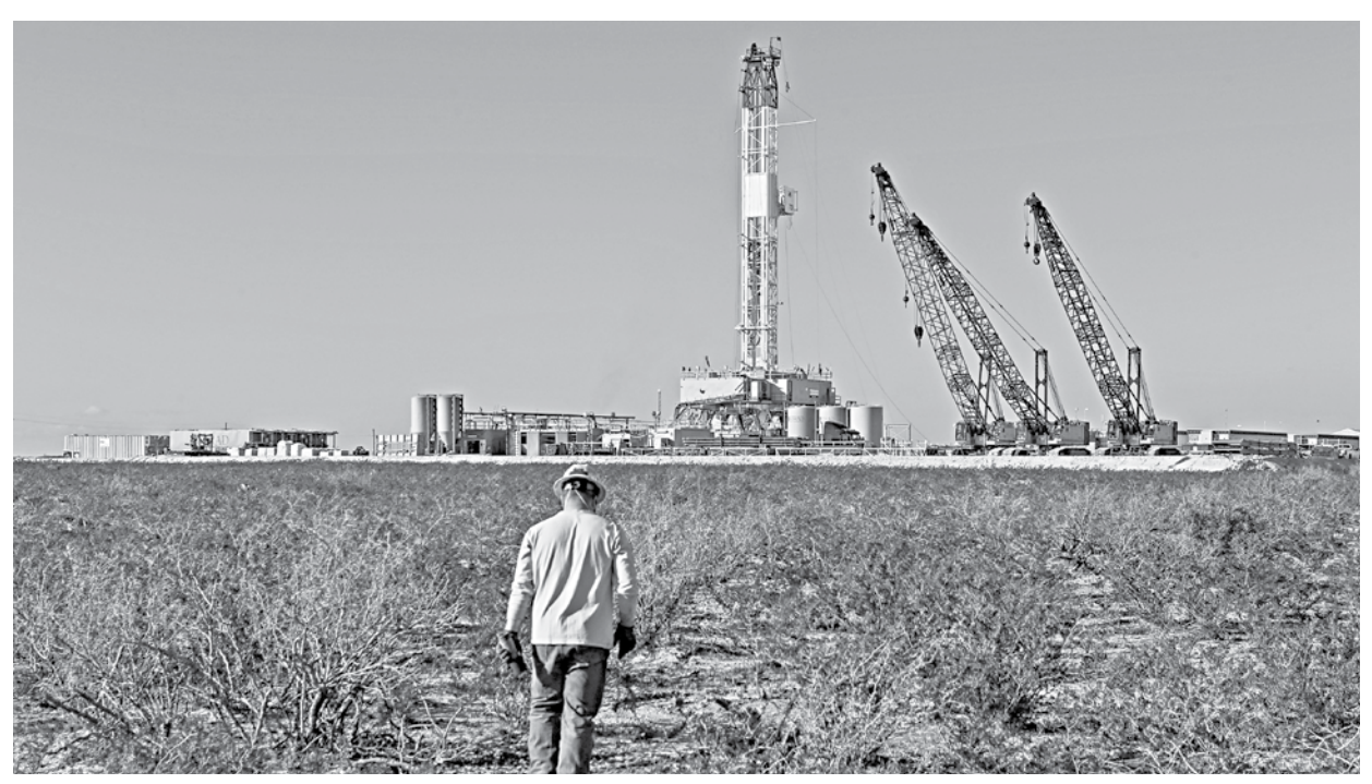
An oil worker walks toward a drill rig after placing ground monitoring equipment in the vicinity of the underground horizontal drill in Loving County, Texas, US.