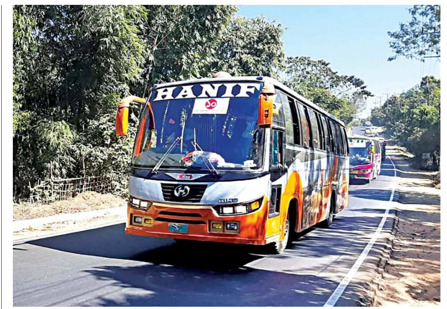
A convoy of buses carry Rohingya refugees for being relocated to Bhashan Char in the Bay of Bengal from Ukhia, Cox's Bazar yesterday.

Only 42.78 acres of land in Mahasthangarh fort city actually belongs to the DoA. The remaining small parts of land include 22.78 acres which constitute the fort city's SEE PAGE 10 COL 1