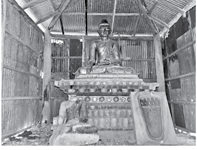
The iconic tin-roofed wooden structure of Dakkhin Hnila Boro Bouddha Vihar, in Teknaf upazila of Cox's Bazar, which was razed to the ground in 2010.Right, the 150-year-old Buddha statue, made of octo-alloy, is still kept in the Ordination Hall of the temple compound.

Hnila Boro Bouddha Vihar, the first Hall -- a separate tin-roofed structure Buddhist temple in Teknaf upazila. to the ground by the offenders.