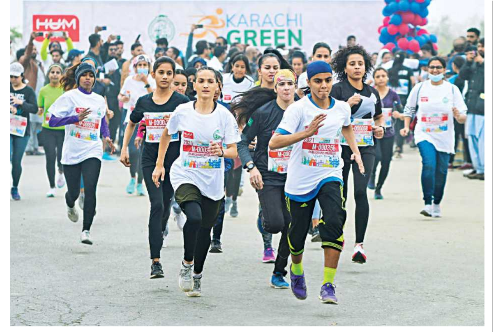
Runners participate in the 'Karachi Green Marathon' organized by the municipal corporation to promote environmental awareness in Karachi, Pakistan, yesterday.