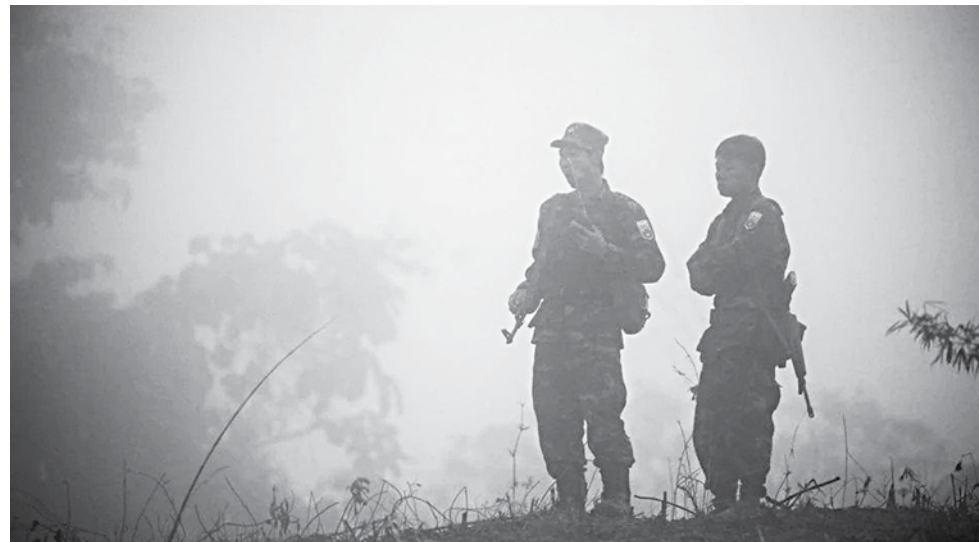
The Tatmadaw not only unleashed a bloody nightmare on the civilians but also ensured that they do not get access to medical care, as they attacked hospitals and medical staff tending to the injuries of the protestors.

raids—in which the military has not only been firing artillery at the locals but also dropping bombs—have led to the displacement of more than 4,200 Karen people, who fled to Thailand. Unofficial estimates put the figure at nearly 10,000. Some shells even fell on the Thai side, according to The Irrawaddy news site.