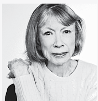
JOAN DIDION American writer (1934 - 2021)

The willingness to accept responsibility for one's own life is the source from which self-respect springs.