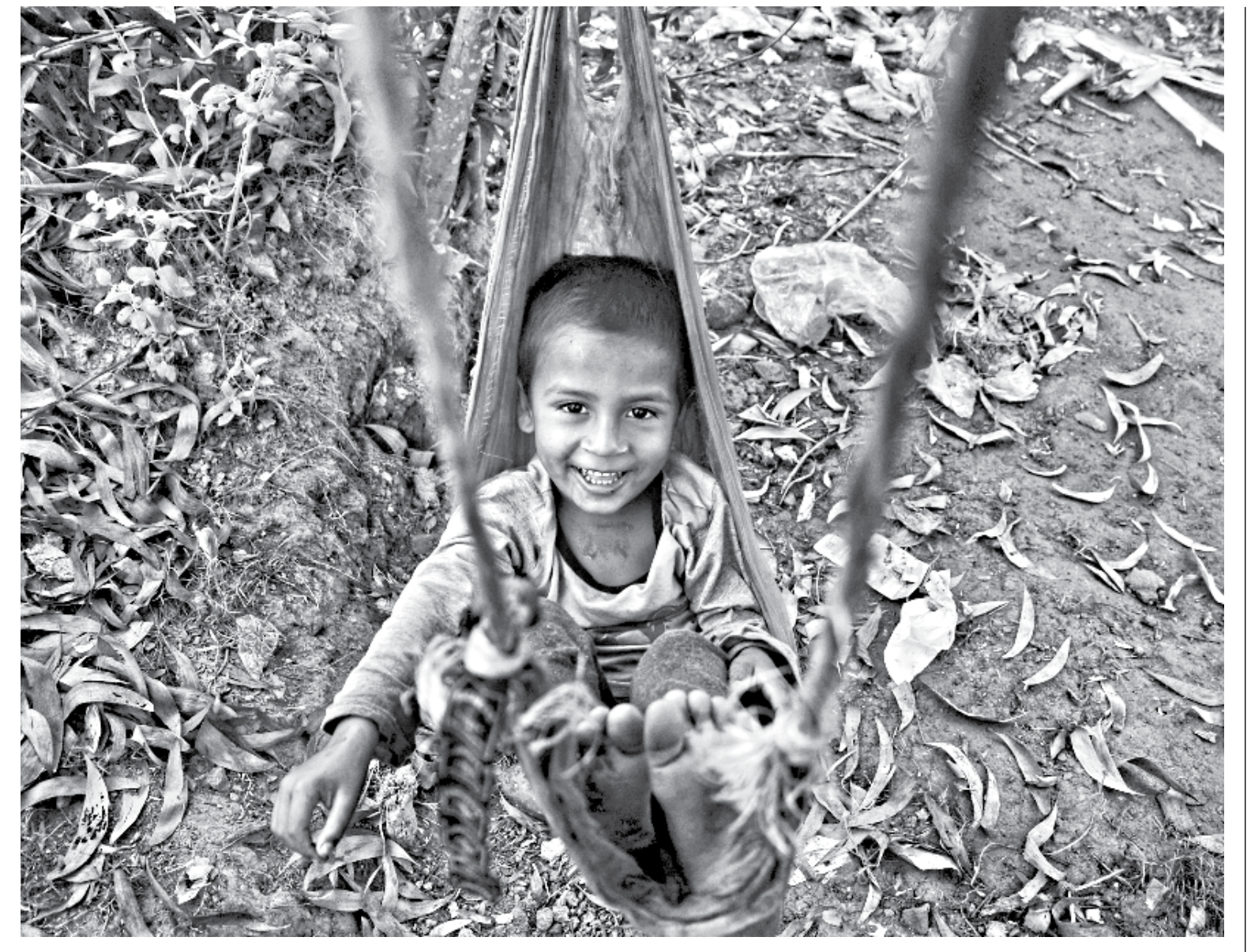
With a smile spreading from ear to ear, a toddler swings on a makeshift hammock carefully crafted by his mother. One can say this was his way of making the best out of the fog-covered winter morning. This photo was taken recently from Khulna's Dumuria area.