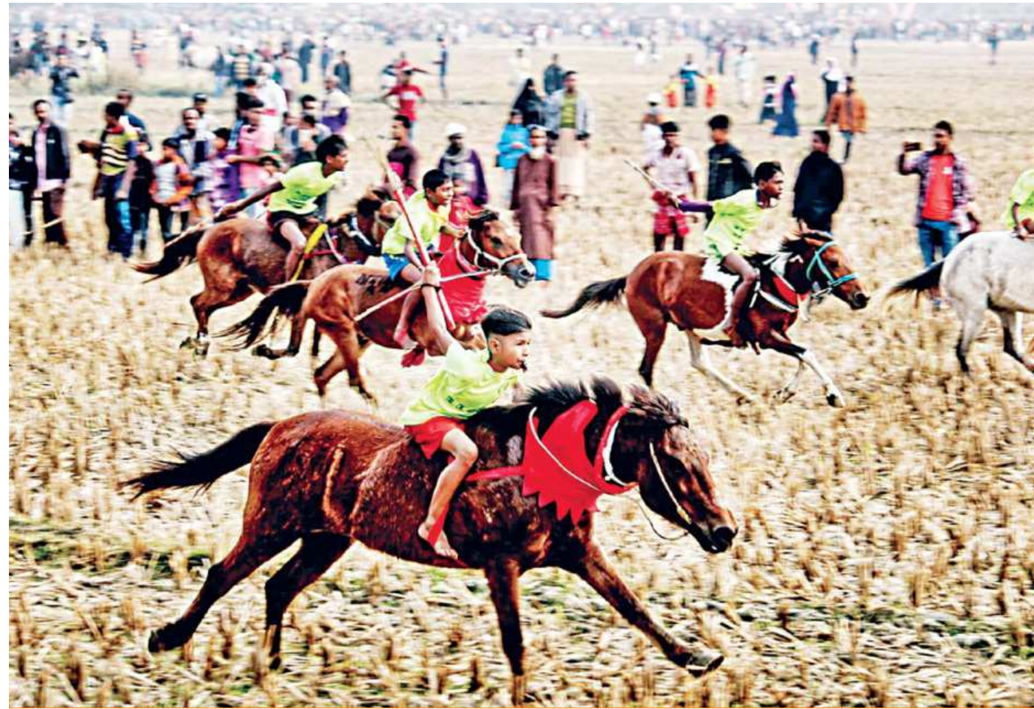
A young boy, with a whistle clamped between his teeth and a whip poised over his right shoulder, stares intensely forward as he drives his horse to go faster during the traditional horse race to mark Victory Day. The photo was taken yesterday from Khulna's Rupsha upazila.