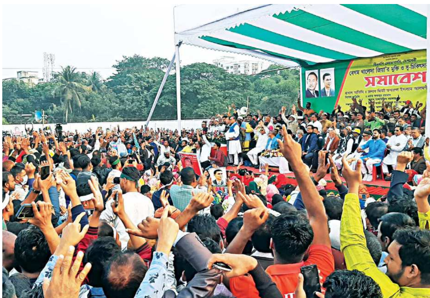
Hundreds gathered at a BNP rally in Gazipur's Shaheed Barkat Stadium yesterday. During the rally, BNP Secretary General Mirza Fakhrul Islam Alamgir asked the government to step down before the formation of an Election Commission.