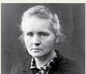
MARIE CURIE Polish-French physicist (1867 - 1934)

Life is not easy for any of us. But what of that? We must have perseverance and above all confidence in ourselves. We must believe that we are gifted for something and that this thing must be attained.