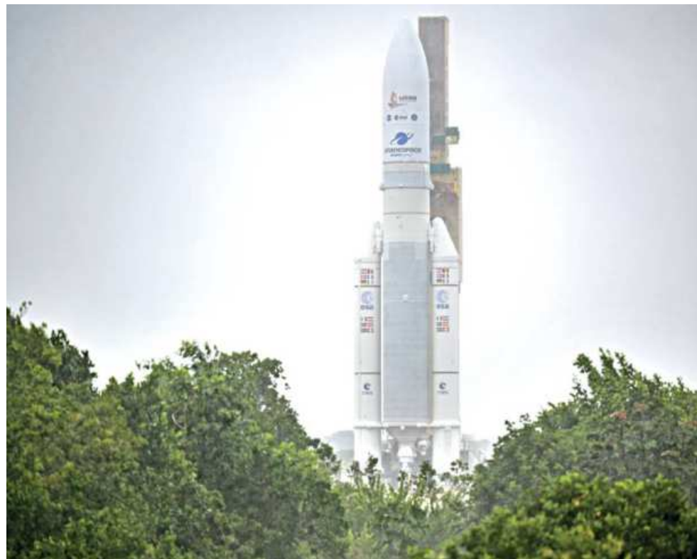
Arianespace's Ariane 5 rocket with Nasa's James Webb Space Telescope onboard is rolled out in the rain to the launch pad, on December 23, 2021, at the Guiana Space Centre in Kourou, French Guiana.

With a 6.5-metre diameter primary mirror shaped like a "golden sunflower" and cryogenic operating temperature—about 225 degrees Celsius below zero—Webb will be the largest and the most powerful space-based telescope—100 times more powerful