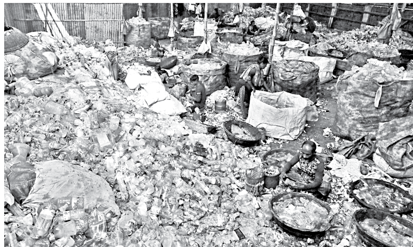
Mismanagement of plastic waste and a lack of enforcement of the laws to regulate plastic use have led to the grim situation Bangladesh is in now.

While our annual national per capita plastic consumption stands at nine kg, it is 100kg in Europe. Yet, we are among the worst affected countries simply because of the mismanagement of the waste.