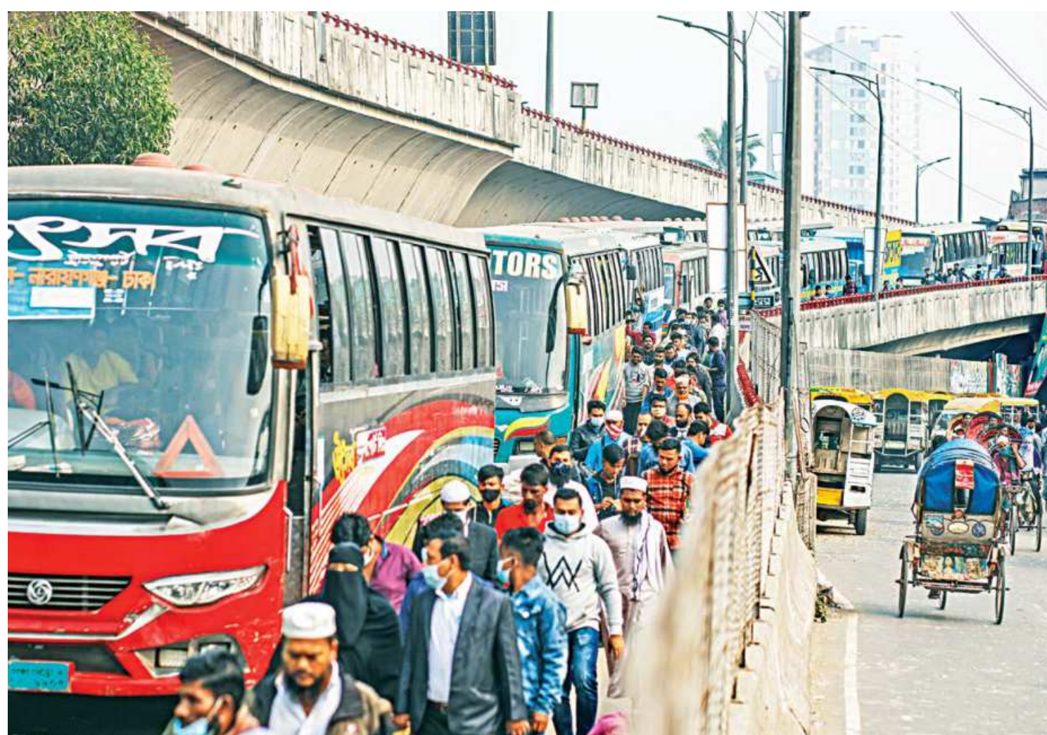
The Mayor Mohammed Hanif Flyover in the capital's Jatrabari was riddled with incessant traffic congestion all day yesterday, leading people to get off their vehicles and start walking towards their destinations. This is quite ironic, given that the flyover was built with the express aim of reducing traffic pressure, in the area and across the city.