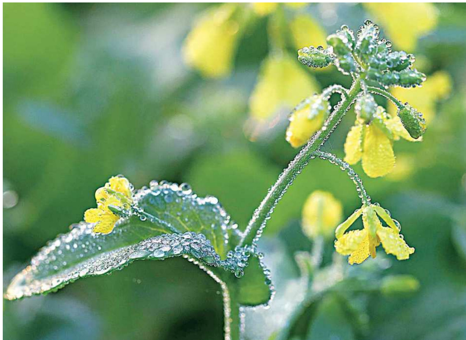
In the biting cold of the morning, it has become increasingly difficult for people to get out for school or work, leaving the comfort of their bed and blanket behind. But once you're out, the winter can offer up a variety of incredible scenes, like the timeless appeal of dewdrops on tiny flower petals. This photo was taken from Modhupur area of Tangail recently.