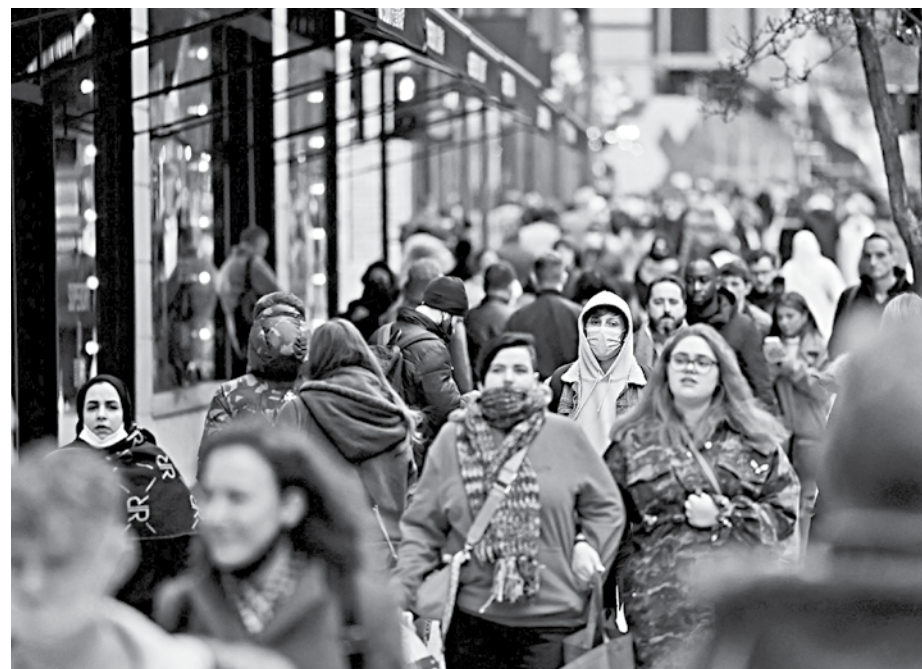
Members of the public, some wearing face coverings to help combat the spread of Covid-19, walk along Oxford Street in London on December 21.

AFP, London Britain's economic recovery from pandemic fallout slowed more sharply than previously thought in the third quarter even before the arrival of the Omicron variant, official data showed Wednesday. Gross domestic product grew 1.1 per cent in the July-September period as the economy reopened, the Office for National Statistics (ONS) said in a statement. That compared with the prior estimate of 1.3 per cent, and followed a downwardly-revised 5.4 per cent growth in the second quarter as global supply disruptions hurt businesses. Economists predict the slowdown will extend into the fourth quarter due to recent curbs aimed at tackling the spread of the Omicron coronavirus strain that emerged in November, while surging inflation and a Bank of England interest rate hike is also set to weigh. Nevertheless, the ONS added Wednesday that the economy was closer to its pre-pandemic level in the third quarter as a result of an upgrade to last year's data. Gross domestic product (GDP) shrank by 9.4 per cent in 2020 on fallout from the Covid-19 emergency health crisis.