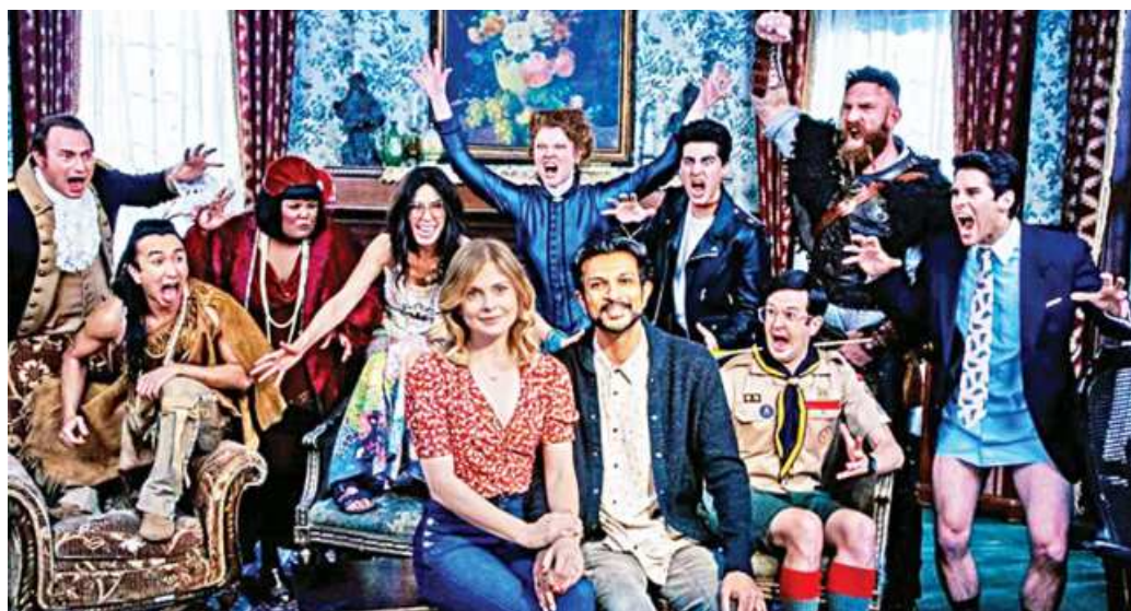
A snippet from 'Ghosts'

"The Matrix Resurrections" is the fourth instalment of the franchise and is set to release on December 22. The film also stars Yahya Abdul-Mateen II, Jada Pinkett Smith, Jessica Henwick, Christina Ricci, Neil Patrick Harris, and Jonathan Groff.