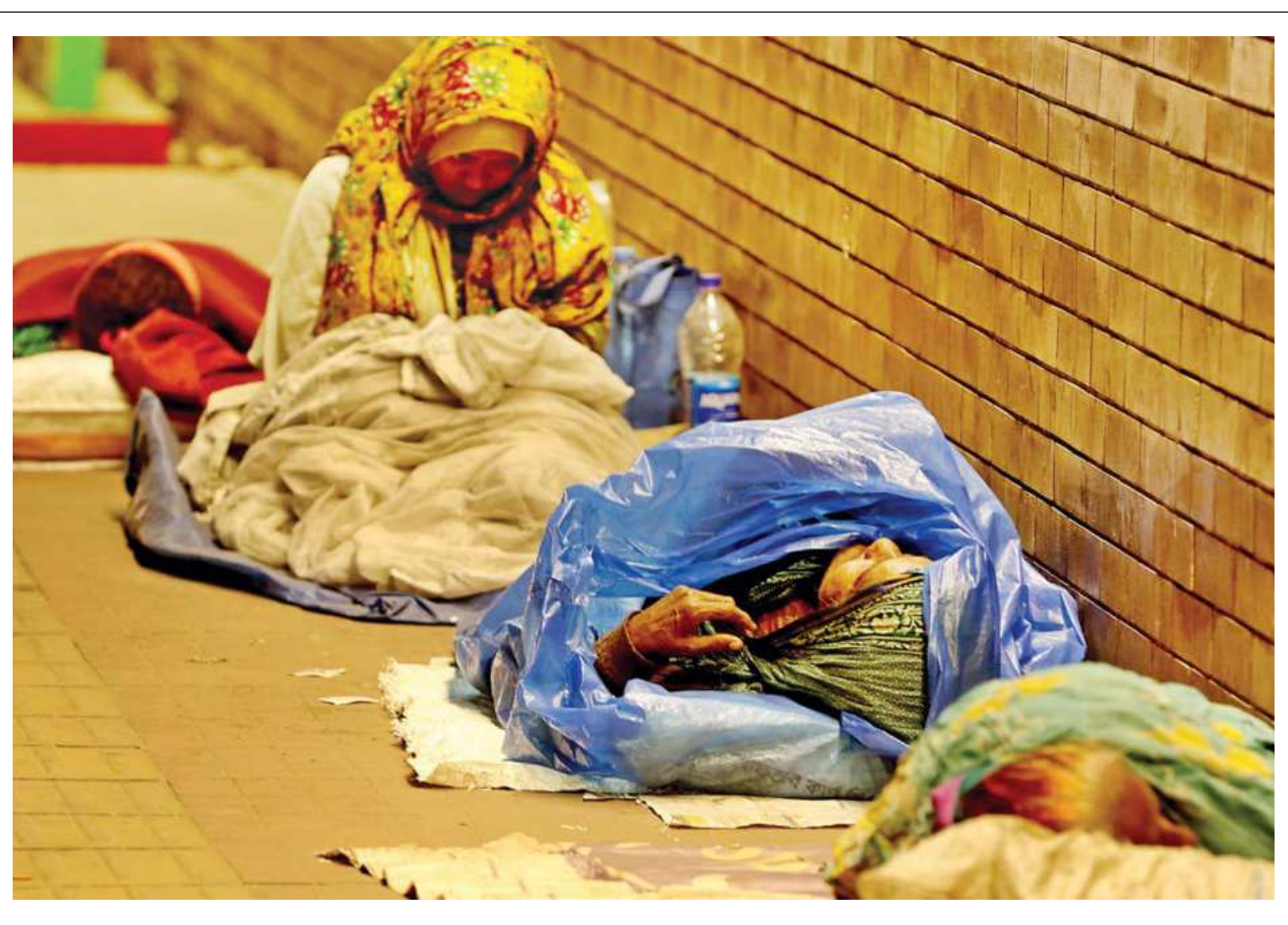
WINTER WOES... A woman covers herself with a plastic sheet, while others manage to stay warm with whatever clothes they have as the season's first cold wave began yesterday. While many people enjoy the chill in the air during this time, those living on the streets struggle to find enough clothes to keep warm. The photo was taken early yesterday in the capital's Karwan Bazar area.