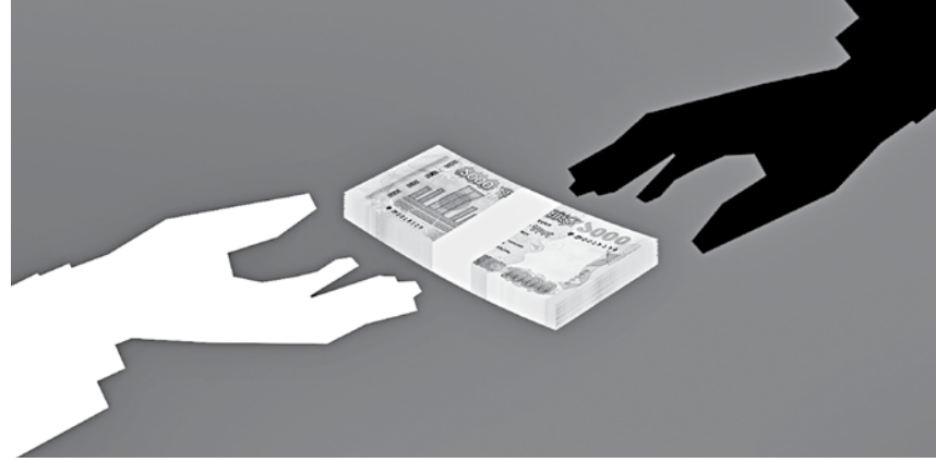
Prevention and control of illicit transfers and money laundering remain highly complex challenges for countries like Bangladesh. ILLUSTRATION: COLLECTED

The lion's share of illicit transfers globally take place out of the poor and developing countries to richer countries and offshore territories in trillions of dollars every year.