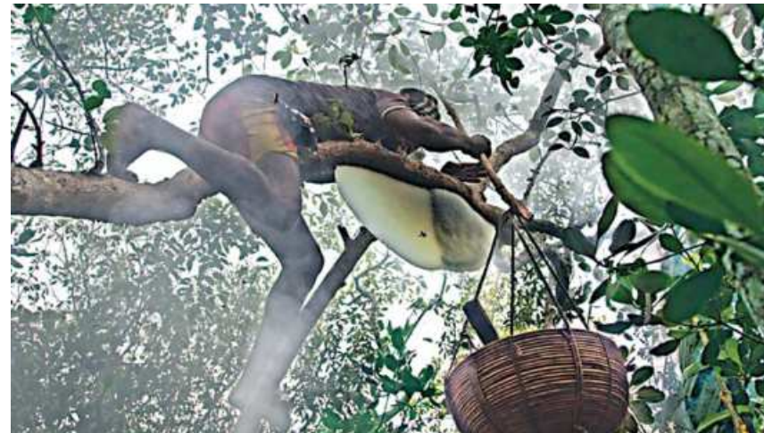
A Mouali in action.