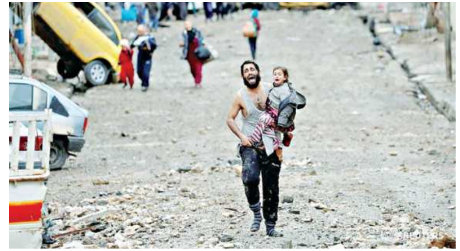
A man cries while carrying his daughter after a US-led airstrike during a battle in Mosul, Iraq. Picture taken on March 4, 2017.

Among three cases cited was a July 19, 2016 bombing by US special forces of what were believed to be three Islamic State group staging areas in northern Syria. Initial reports were of 85 fighters killed. Instead, the dead were 120 farmers and