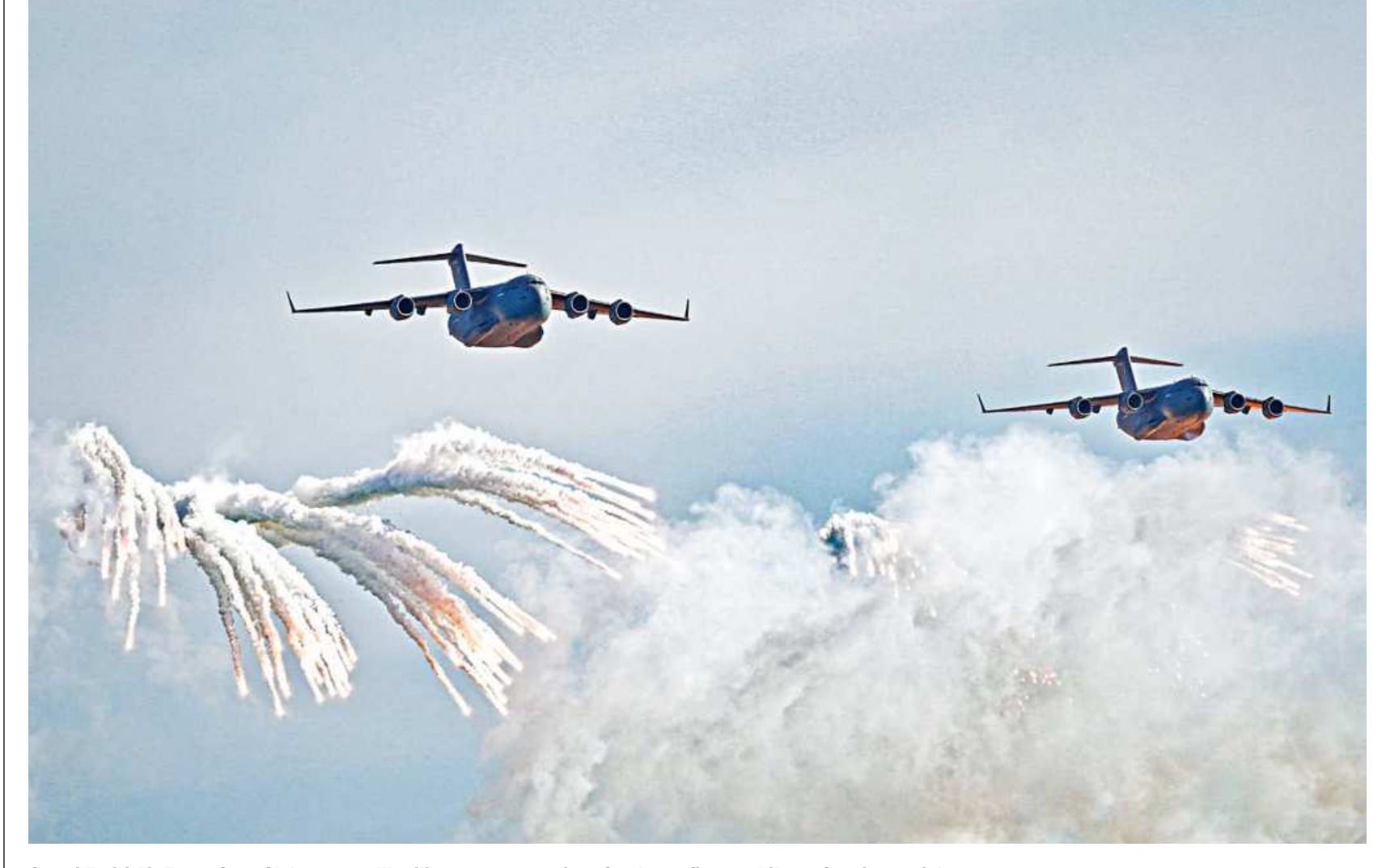
Qatari Emiri Air Force C-17 Globemaster III military transport aircraft release flares while performing aerial maneuvers in the sky above Qatar's capital Doha as the Gulf state marks its National Day, yesterday.

infrastructure in already impoverished areas.