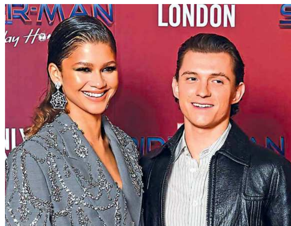
Zendaya and Tom Holland.

"Why not just let it be? Honestly, [I] never thought of it as a thing because my parents were always that way, so I didn't know that people cared," she said.