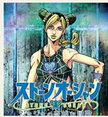
Jojo's Bizarre Adventure: Stone Oceans

Small-time crook Johnny Bolt gathers a ragtag group of supervillains for one