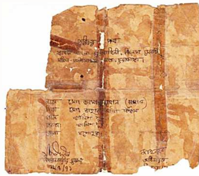
Identity card issued to a suicide squad member

In the meantime, we had established a liaison with the Indian government, which appeared to be helpful to our cause. I then organised a large gathering in the public square near the general post office of Jhenaidah town to guide people through an orderly withdrawal.