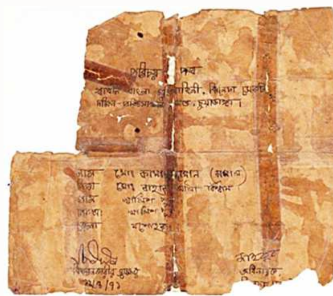
Identity card issued to a suicide squad member

THE SUICIDE SQUAD: 12 BRAVE YOUNG MEN After victory in the initial war of resistance,