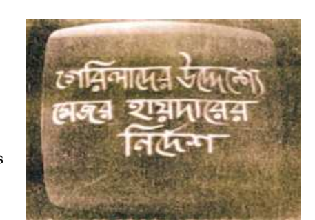
Display of Major Hyder's instructions to freedom fighters on TV.

Image courtesy: Habiul Alam's book "Brave of Heart"