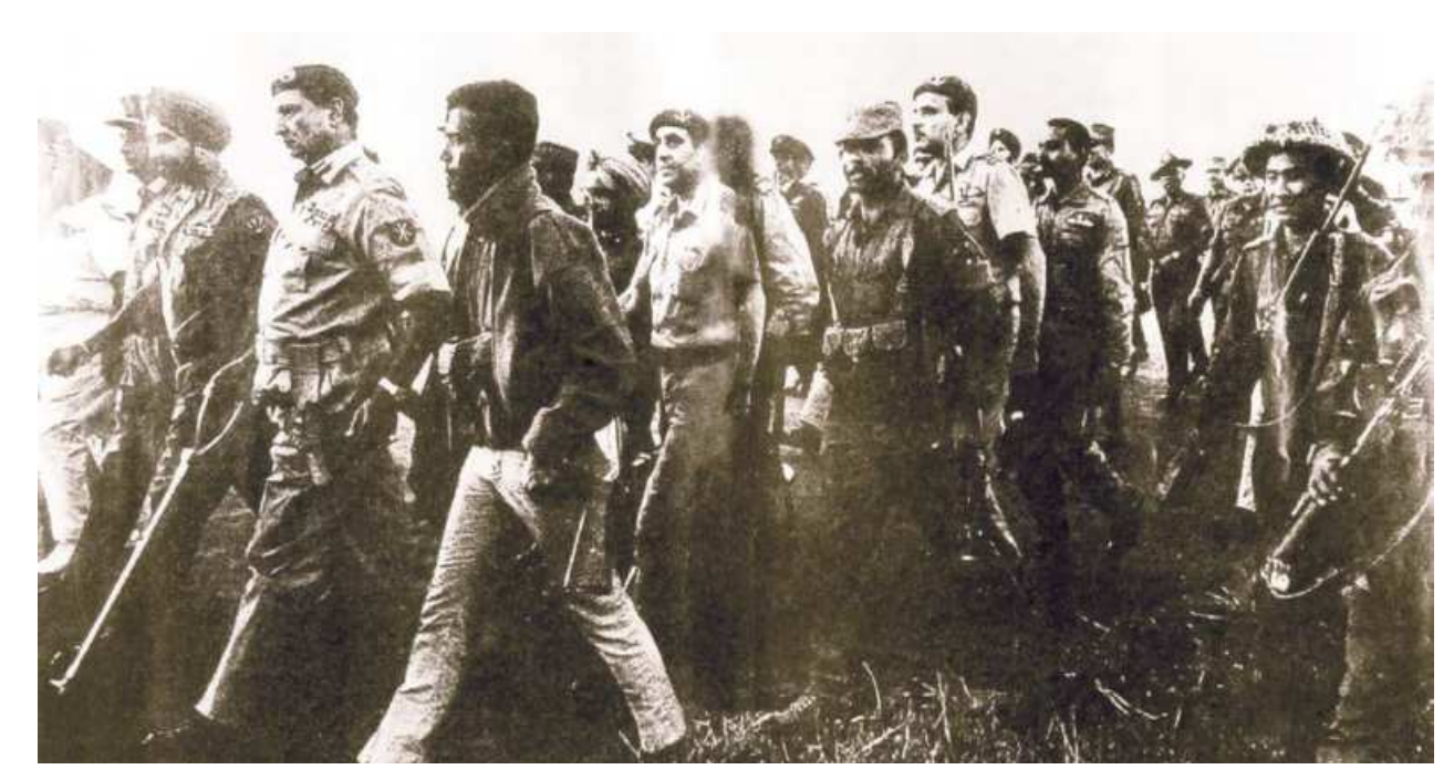
Lt Gen Niazi flanked by Major Hyder of Bangladesh forces and Lt Gen Aurora of Indian Army (eastern command) going for the surrender ceremony.