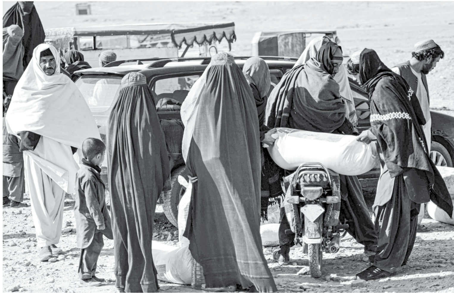
People collect food aid distributed by the Red Cross in Kandahar, Afghanistan yesterday. A senior Red Cross official said he was furious that sanctions and donor freezes are cutting off basic services in Afghanistan, and he called on donors to find creative ways to prevent a "massive humanitarian crisis".