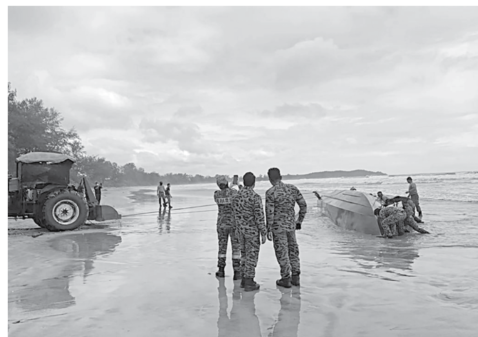
This handout photo taken and released yesterday by the Malaysian Armed Forces shows a vessel being brought onto shore after capsizing near Tanjung Balau off the coast of Johor, in an accident that authorities said killed 11 Indonesian migrants and left 27 more missing.

The lawmakers encouraged the Biden administration to keep insisting that China not intervene in the selection of the Dalai Lama's reincarnation, amid fears that the officially atheist government will groom a pliant successor.