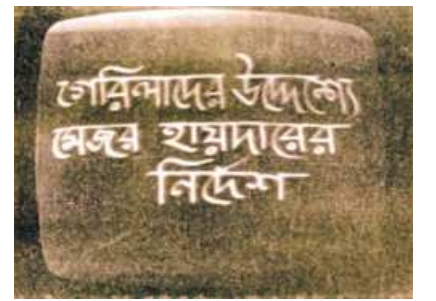
Display of Major Hyder's instructions to freedom fighters on TV.