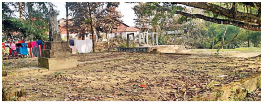
A memorial to the victims of Khadim teagarden massacre.