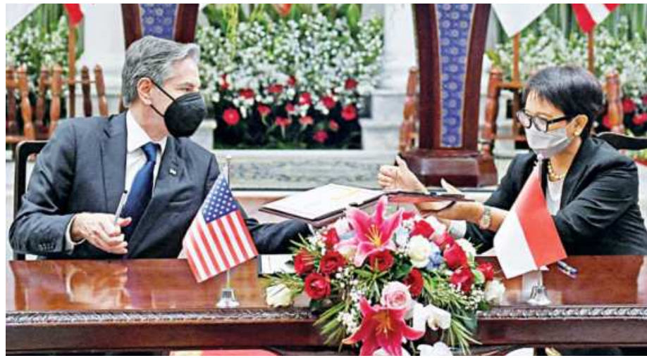
US Secretary of State Antony Blinken and Indonesia's Foreign Minister Retno Marsudi sign a MOU at the Pancasila Building in Jakarta, Indonesia, yesterday.

» Putin and Xi to discuss 'aggressive' talk from US and Nato today