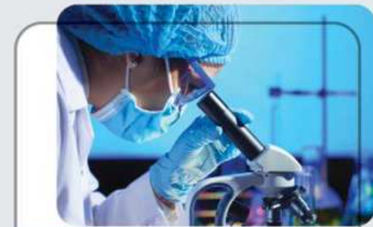
Human Resource Development