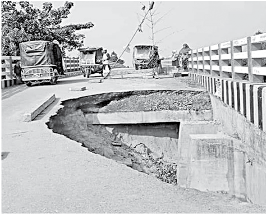
Plying of heavy or medium vehicles remains snapped since a large portion of this bridge, on Naaldiga river in Netrakona's Kalmakanda upazila, collapsed a few weeks ago.