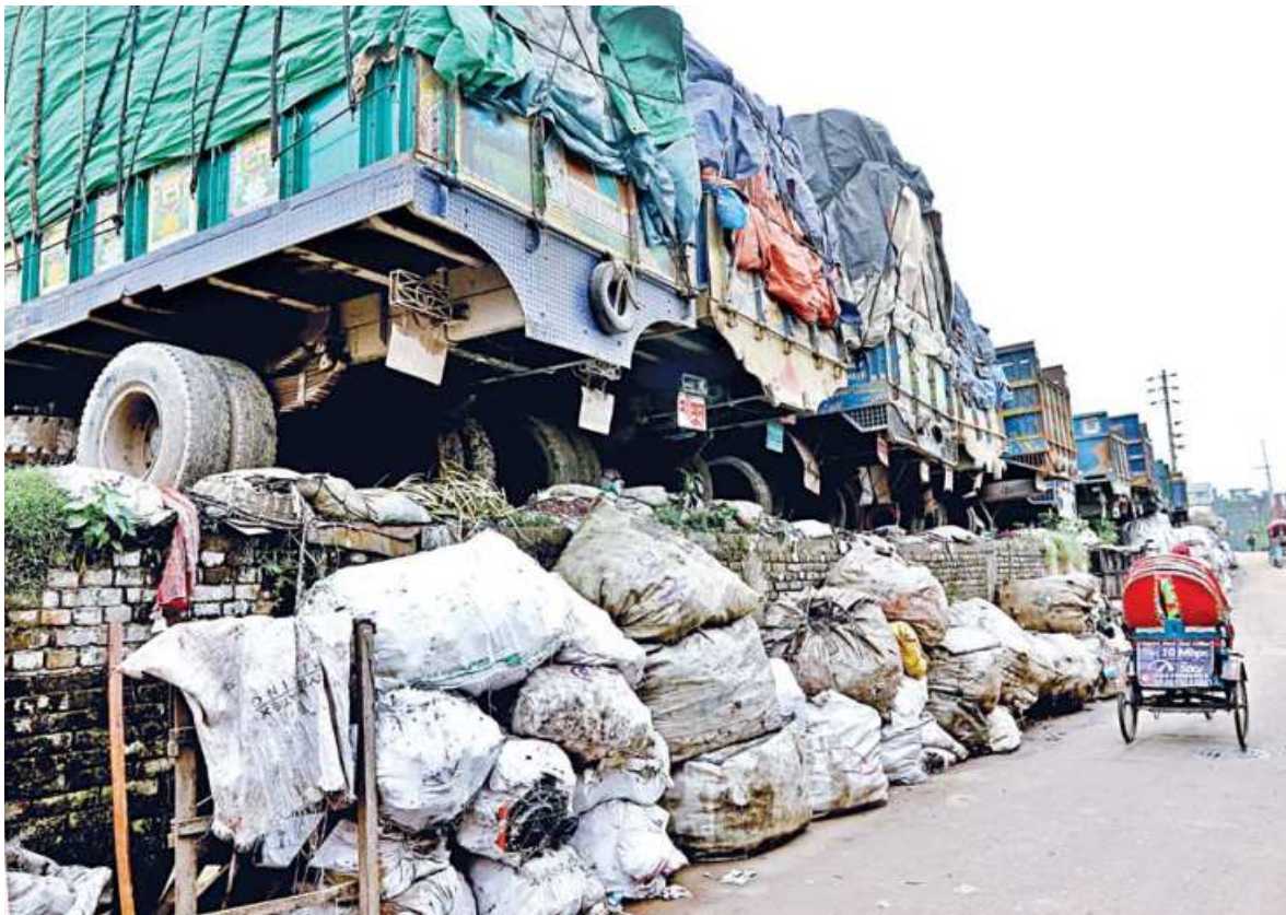
Loaded trucks are parked near Raja Narayan Dhar Road in Lalbagh area of the capital yesterday. Locals claimed that the truck stand is illegal and has been set up occupying the land of the BIWTA.