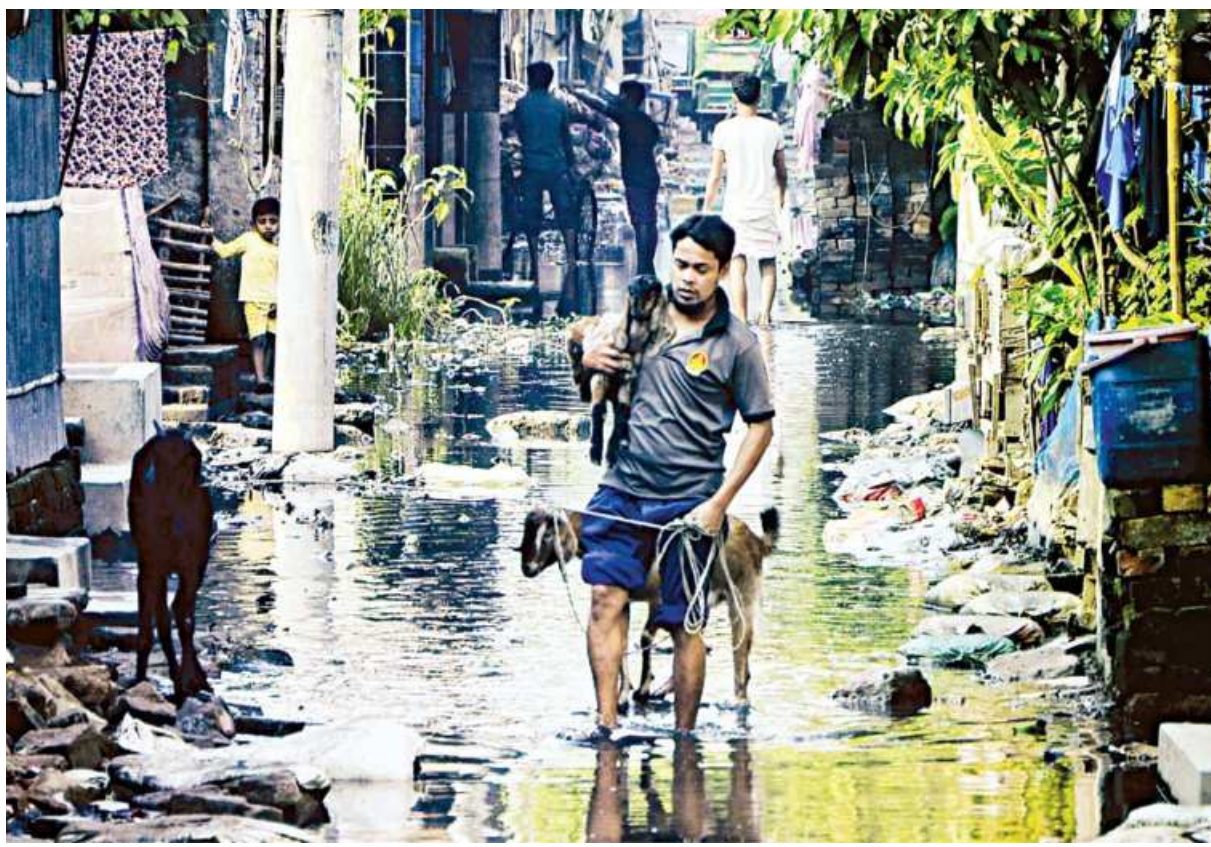
A neighbourhood street at Bastuhara Colony in Khulna city resembles a gutter and smells even worse as rain water mixed with sewer water inundates the area due to poor drainage.