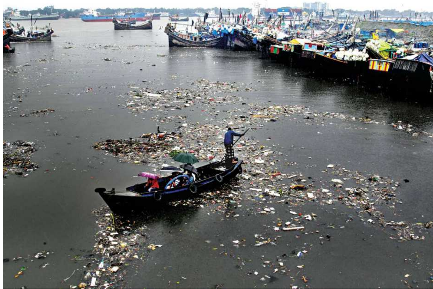
Two boatmen navigate their vessel through clumps of garbage on the Chaktai Khal in Chattogram. Waste carelessly dumped in the city's canals find their way to the Karnaphuli river, causing environmental damage. The photo was taken recently.