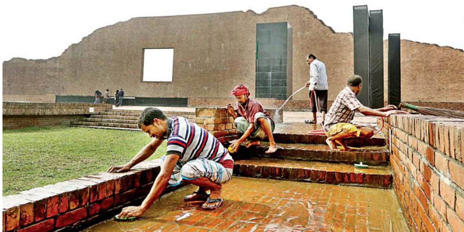
Workers cleaning the steps and walkway of the Martyred Intellectuals Memorial in the capital's Rayerbazar yesterday, ahead of the Martyred Intellectuals Day to be observed on December 14. On the day, people from all walks of life visit the monument to mourn and pay respect to the intellectuals killed by the Pakistan occupation army at the fag end of the 1971 Liberation War.