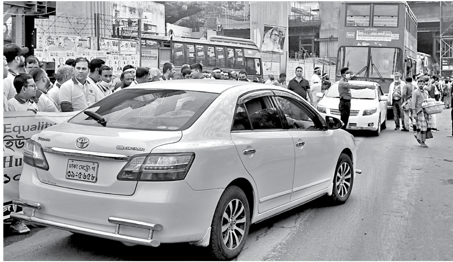
Amidst metro rail construction and the usual gridlock of the city, a private car was seen driving the wrong way near Jatiya Press Club yesterday, and that too right in front of a traffic police officer. This practice, which shows a clear disregard for traffic rules, creates obstruction in the usual flow of traffic, and potentially puts pedestrians in danger.

"It's my dream to join the police. I hope the higher authorities will consider my applications and help me achieve my dream," she said.