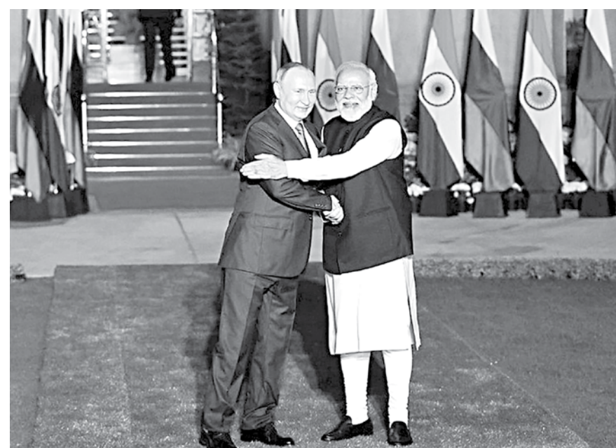
Russia's President Vladimir Putin shakes hands with India's Prime Minister Narendra Modi ahead of their meeting at Hyderabad House in New Delhi, India on December 6, 2021.