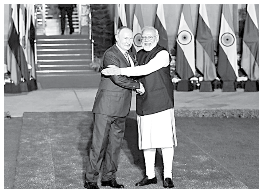
Russia's President Vladimir Putin shakes hands with India's Prime Minister Narendra Modi ahead of their meeting at Hyderabad House in New Delhi, India on December 6, 2021.