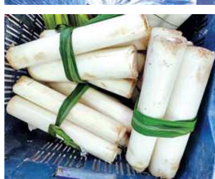
(Clockwise from left) From papayas, bananas and bitter gourd to the stems of banana trees, all types of fruits and vegetables native to the Chittagong Hill Tracts are seen on display at a store in Dhaka's Mohammadpur. Shops like these are becoming increasingly popular due to the growing appetite for organic food among city dwellers.