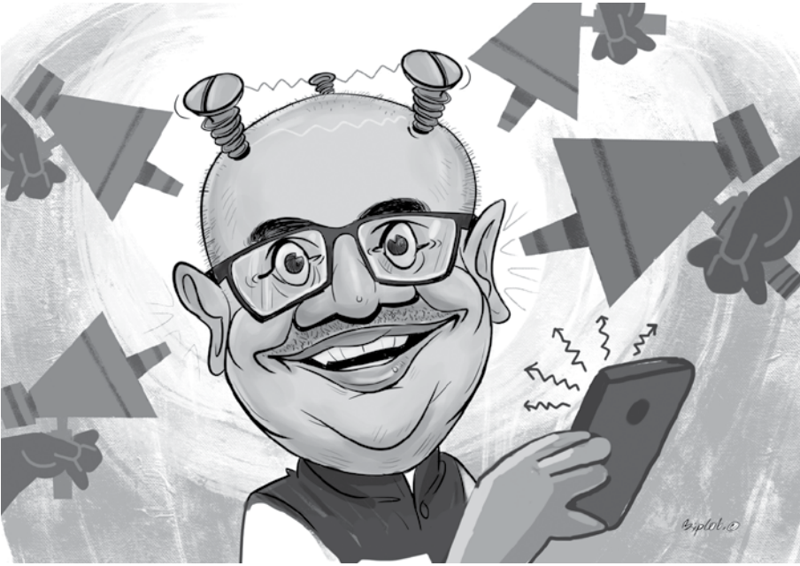
ILLUSTRATION: BIPLOB CHAKROBORTY

be enough to land him in trouble? In a country where an MP can stand up in parliament, in the very seat of our democracy, and argue that scanty clothes and too much liberation is the reason behind women being raped—where a judge can imply that rape victims who consent to drinking, dancing and partying are also consenting to being raped—would a state minister be reprimanded for his offensive and misogynistic comments? Or would this be laughed off and accepted as one of those “boys will be boys” (read: men will be toxic and misogynistic with impunity) situations? It is now clear that the final nail