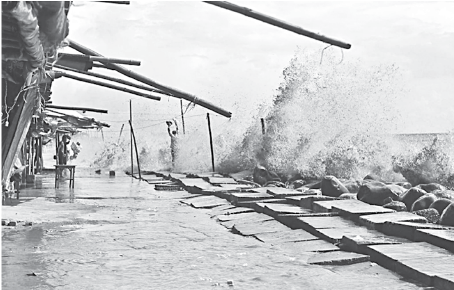
Over the past decades, Bangladesh’s tryst with extreme climatic events have continued to increase in terms of intensity and frequency.

AS the world’s biggest conference on climate change drew to an end last month in Glasgow, we cannot but help look back at what was said and heard. For Bangladesh and all other climate vulnerable countries, COP26 carried a lot of significance, keeping in mind its national and regional interests. Over the past decades, Bangladesh’s tryst with extreme climatic events have continued to increase in terms of intensity and frequency, proven by the regular experiences of floods, cyclones, storm-surges, and droughts. Moreover, the recently published sixth assessment report of the Intergovernmental Panel on Climate Change (IPCC) has sent out a clarion call for the world, citing that “tipping points”