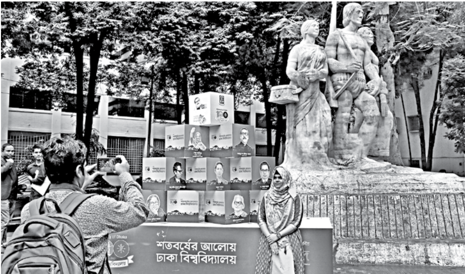
A fresher poses for a photo in front of Aparajeyo Bangla to keep as a memento, marking the beginning of their academic journey at Dhaka University. Many students visited the campus yesterday to choose their favourable subjects, and as a bonus, caught a glimpse of the ongoing centenary celebrations.