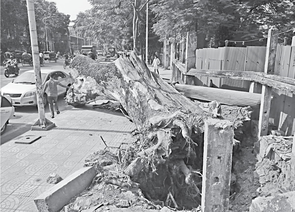
This tree, uprooted by heavy downpours and thunderstorms, turned into a sight in itself, telling tales of its own defeat. But this has posed to be a risk for the pedestrians passing by this footpath opposite of the DSCC Nagar Bhaban, in front of Osmani Udyan. Staffers from Dhaka South City Corporation cleared the branches but left the trunk lying here. It has almost been a month of unnecessary inconveniences faced by pedestrians due to authorities' negligence. The photo was taken recently.

Amid protests, BCL expelled 12 leaders of Buet unit for breaching its discipline. The Buet authorities on October 11 banned all political activities on the campus. Later, on November 21, they expelled 25 students, mostly BCL leaders and activists.