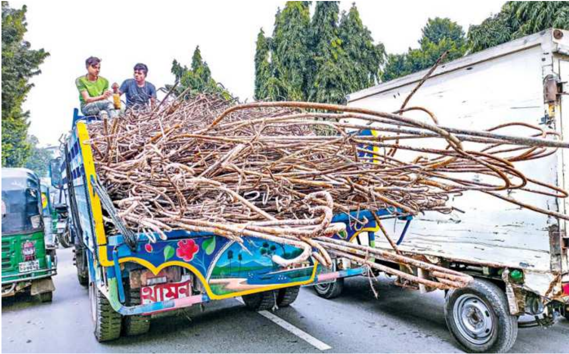
A small truck trundles on Bijoy Sarani in the capital yesterday carrying used iron rods that are sticking out, putting other road users at risk. Clearly the load should have been on a longer truck that could fit all of it on its bed and not put other road users at risk. Trucks are banned on Dhaka streets during the day.

This information has been confirmed by Enzamul Haque, a master's student of Dhaka State University, who is one of the leaders of the safe road movement.